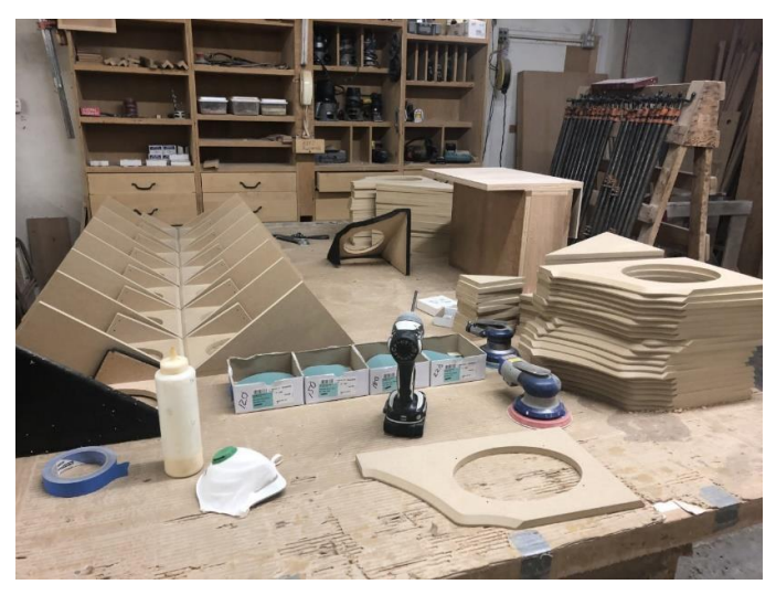
Our production facility

For questions about installation, please contact us at 208-801-8179 . Please visit our website for more C3 Corvette products at <a href="https://www.lnnovativeCorvetteProducts.com">www.lnnovativeCorvetteProducts.com</a>