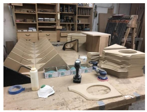
Our production facility.

Now that your speakers are wired up, turn on your stereo and do a quick test to verify that both speakers are working correctly. Once proper functionality has been tested, you can now mount your speakers to the cabinets using the four pre-drilled holes. For questions about installation, please contact us at 208-801-8179. US Patented - Made in the USA